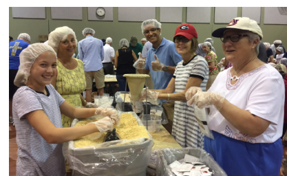
Rise Against Hunger August 19 Event: 1-3 p.m. Pre-packing lunch at noon Pack 30,000 meals