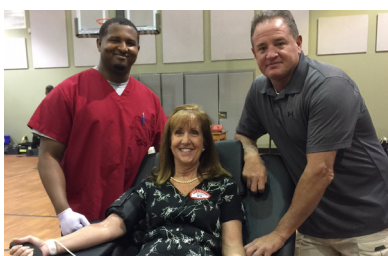
Blood Drive July 22 8 a.m. to 1 p.m. Select specific time at fayettevillefirst.com .