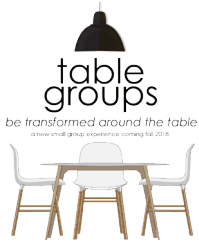
Table Groups — a small group meeting with the goal of spiritual transformation ... a place for real, honest, and deep conversations about life and faith.