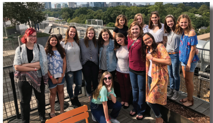
Youth girls took a trip to Ponce City Market. The guys shared time together at a Falcons game.

Our students have been all over Georgia in the last few weeks! While studying the Reformation, our Confirmation Class traveled to Emory University to tour Candler School of Theology to see documents about Martin Luther and we went to Holy Trinity Catholic Church to learn about our Catholic neighbors. Also, our high school girls took a trip to Ponce City Market and the high school guys enjoyed a Falcons football game. Finally, everyone joined together for a good old-fashion corn maze.