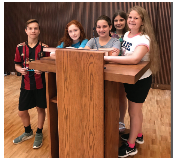
Confirmation students enjoyed a field trip to Emory's Candler Theological Seminary as part of their year-long confirmation process.