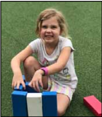
Mills will attend Crabapple Lane Elementary and wants to work at Great Wolf Lodge.