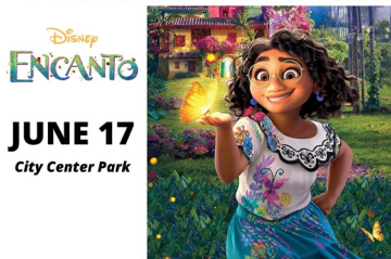
FFUMC KIDS Scavenger Hunt with Prizes!

Ready to get creative this summer? Children in grades 3-6 will dive deeper into the lessons and adventures of our VBS Bible stories as they explore ways to develop their own personal leadership skills. Campers will learn music and dances, learn how to create and build set designs, as well as participate in traditional camp crafts and games. June 20-24. $10/camper