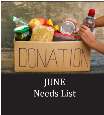
JUNE Needs List