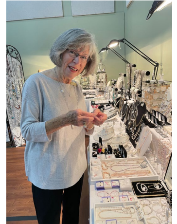
Vendors are getting ready for this BIG event.