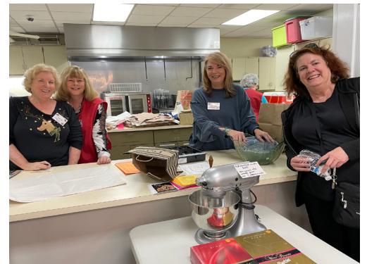
Lots of helping hands make Timeless Treasures a HUGE success.

More information is coming soon. We hope you'll put the event on your calendar and are able to volunteer to help make the 2023 Christmas Marketplace the best one yet!