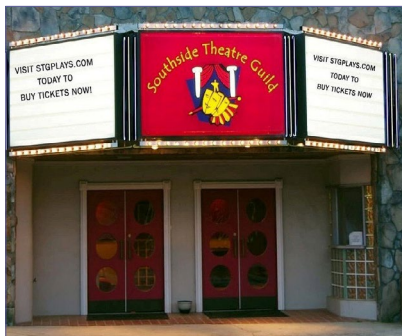
April 20 "A Time to Kill"