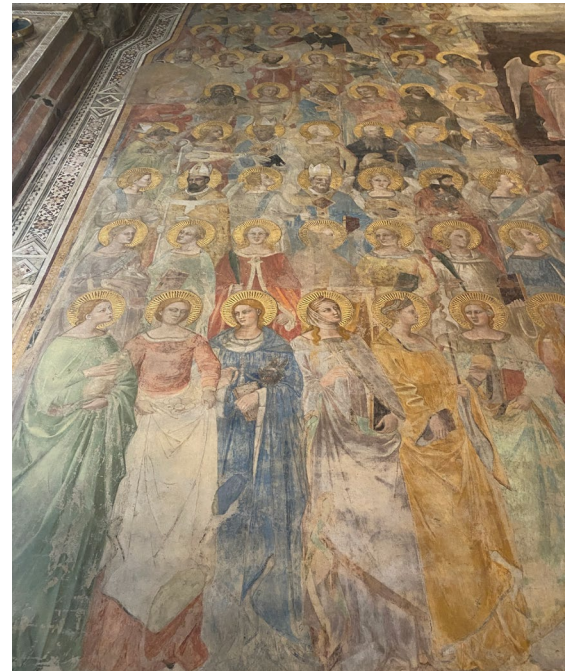
Paradise, painted in 1355 by Nardo di Cione

We have days like these so that we might remember and be thankful. We honor the memories of those we love, but we also remember that these great saints still live. They live eternally with God, and a piece of them lives with us. So you may not know very many names in my very large Great Cloud, but in a way you do. You see a part of them, and the mark they've left, every time you see me.