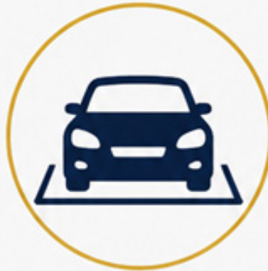
PARKING LOT B