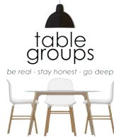
Table Group offerings: