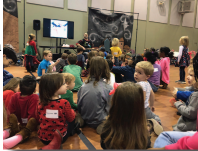
Parents got a break before Christmas while 68 children enjoyed camp here at FFUMC.

As we pass through Christmas and head into the New Year, I am reminded of the gifts our God has bestowed on us and the Hope he provides. I do not naturally like change, but this past year has helped me come to understand that change is neither good nor bad.