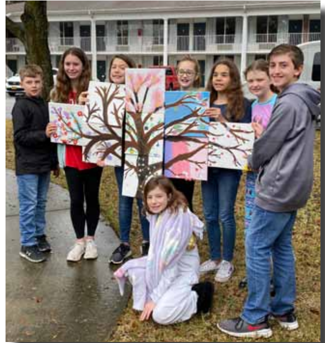
Confirmation students get creative on their retreat.

Also, all youth are invited to celebrate that weekend with a Black Light Lock-in. Drop-off at the church at 9 p.m. on Friday, March 13, and pick-up at 7:30 a.m. on Saturday, March 14.