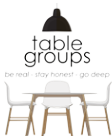
TABLE GROUPS CONTINUE TO GROW