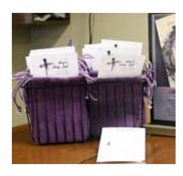
Lenten offerings may be placed in the church office side door or you may donate online or by mail. Just mark "Lenten Offering" in the memo line.

If you would like to help by running errands, delivering supplies, or staying connected with people in our congregation, <u>click this link</u> so we can better connect you with those who have a need.