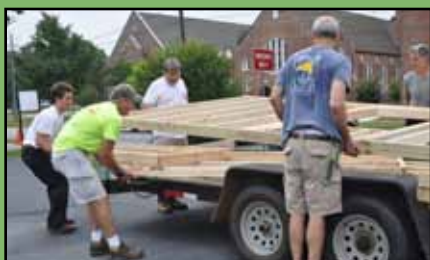
June 27: Walls built for home in FFUMC parking lot, then loaded and transported to build site.

Tools of LOVE at work! Fayetteville First UMC, our local Square Foot Ministry, America's Home Place, and The United Methodist Church Alabama-West Florida Conference completed a home in Port St. Joe, Florida. One square foot at a time, we are building in love.