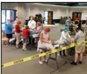
Rise Against Hunger Event Last year's event on left; new COVID safety shown on right.