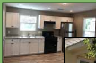
Beautiful house all done and ready to become a home.