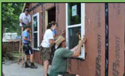
July 7-10: Home constructed in Port St. Joe (eight volunteers from FFUMC helped).