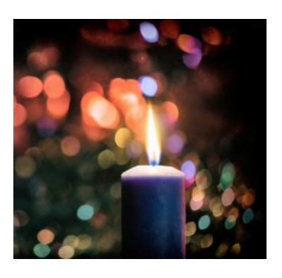
December 21 Blue Christmas

The Field: 6 PM Story, Photo op, Bonfire, Carols