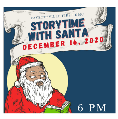
December 16 Storytime with Santa & Bonfire

The Field: 6 PM Story, Photo op, Bonfire, Carols