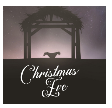
December 24 Candlelight Services

Online Service Encouragement and hope for this "longest night"