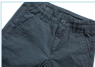
Boys Pants/Shorts Shirts

Tip before donating: Anna Mayhew reminds us to drink LOTS of water!