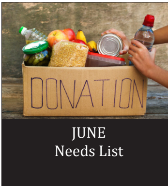
JUNE Needs List