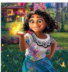
FFUMC KIDS Scavenger Hunt with Prizes!